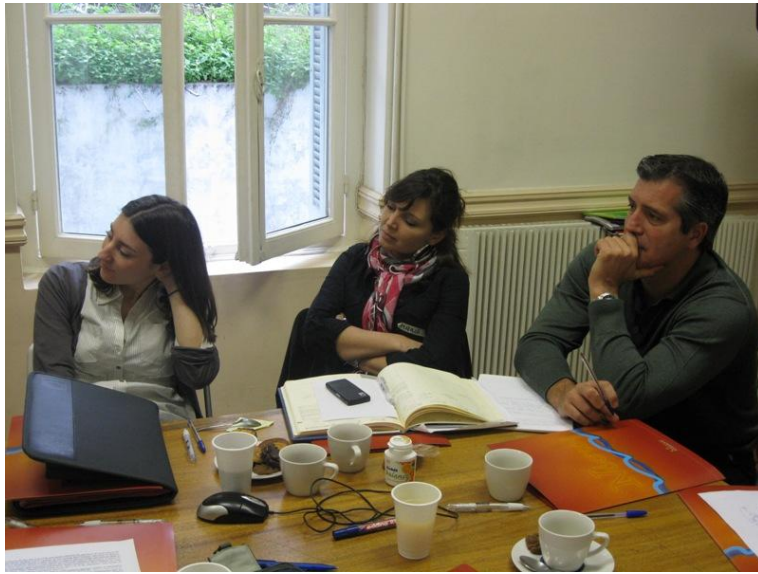
The Greek Team “E.K.P.O.SPO- NOSTOS”